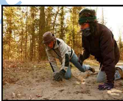
fig1: in olden days animal tracking

in this figure simple representation in olden days and also presented days in some areas it plan will be applied because that areas has no technology . That way those are fallow this method.