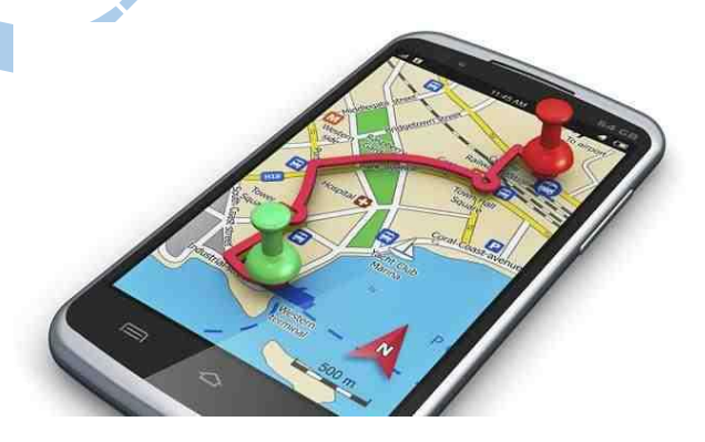
fig 3: output representation and intration between smart phone and chip interaction.

in this above figure we can easily analysis what is the process is going on and how it is used total representation in the fig 3. it is very easy processing to about how to find out the animals.. Hear no suffering about the any problems. By using this process we can save the money and time without tension. In this technology is very useful for formers and whose are depends on the profit from animals.