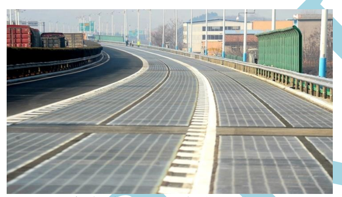
Fig:1 Infrastructure of solar road way

The Solar Roadway distributes its electrical power to all businesses and homes connected to the system via their parking lots and driveways (made up of Solar Road Panels). In addition to electrical power, data signals (cable TV, highspeed internet, telephone, etc.) also travel through the Solar Roadways, which acts as a conduit for these signals (cables). This feature eliminates the unsightly power lines, utility poles, and relay stations we see all over the countryside[2]. It also eliminates power interruption caused by fallen or broken electrical lines or poles.