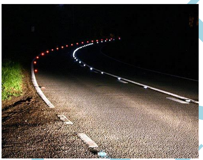
Fig: 4 Illuminated Highway at Night

The LEDs can also be programmed to move along with cars at the speed limit and it gives warning to the drivers instantly when they are driving too fast or the speed of the car increases beyond the speed limit. The LEDs will also be used to paint words right into the road; it gives warning to drivers if an animal arrives on the road, a detour ahead, an accident, or construction work. Central control stations will be able to instantly customize the lines and words in real time, alleviating traffic congestion and making the roads more efficient as well as safer[5-6].