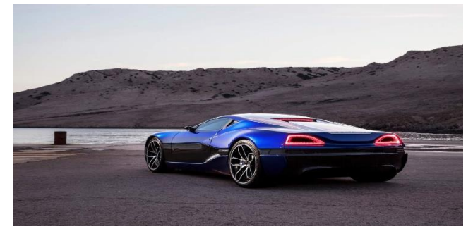
Fig: 6 Currently the electric vehicles are charged from electricity produced from power plants.

The scientific survey in America says (as per July 2010) that the EVs are not ecological in many areas due to less supply or restricted supply of electricity to the areas. A true accounting of the environmental consequences of these cars would have to include the emissions of the power plants that supply their energy. When Department of energy researchers carried out such an analysis, they found that the results are very considerable with geography. By dividing the country into different regions as per the power sources within each region - generally, a combination of coal, natural gas and nuclear energy, with a smattering of renewable energy thrown in. And check how a new fleet of electric cars would alter that supply. Nuclear and renewable, which together account for less than a quarter of the electricity supply, are "always on" sources. Their energy gets used up quickly for routine tasks, leaving little to no green energy left over to help charge a burgeoning fleet of electric vehicles. In practical terms, this means that even if you live down the street from wind farm, its energy is already spoken for before you plug-in your plug[5].