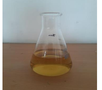
Figure 1: Mentha piperita plant extract

20 g of mentha piperita leaves were washed thoroughly with distilled water and dried for 24hrs at room temperature. The extract solution was prepared by boiling dried leaves in Erlenmeyer flask with 100 ml of distilled water for ten minutes at 100°C. Freshly prepared aqueous extract was then used for synthesis of silver nano particles (Figure:1).