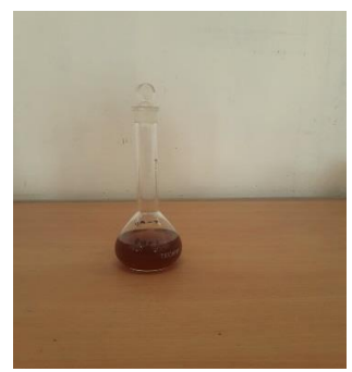
Figure 2 : Synthesized Silver nanoparticles