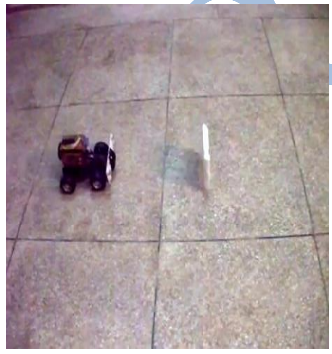
Object from the original frame has been taken and global threshold procedure is used manually to select the best possible threshold value which gives exact number of pixels composing the object