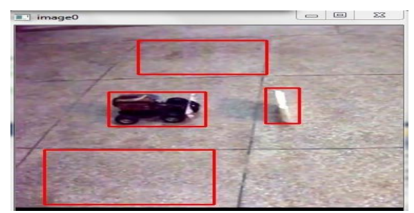
Classification of pixel forming object in robot video