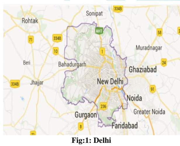
IV. MEASUREMENT OF NOISE

Delhi is the capital of India and seat of the executive, legislative, and judiciary branches of the Government of India. It is also the centre of the Government of the National Capital Territory of Delhi. New Delhi is situated within the metropolis of Delhi and is one of the eleven districts of the National Capital Territory of Delhi. The foundation stone of the city was laid by George V, Emperor of India during the Delhi Durbar of 1911. It was designed by British architects, Sir Edwin Lutyens and Sir Herbert Baker. The new capital was inaugurated on 13 February 1931, by India's Viceroy Lord Irwin. Although colloquially Delhi and New Delhi as names are used interchangeably to refer to the jurisdiction of NCT of Delhi, these are two distinct entities, and the latter is a small part of the former. Calcutta (now Kolkata) was the capital of India during the British Raj until December 1911. However, Delhi had served as the political and financial centre of several empires of ancient India and the Delhi Sultanate, most notably of the Mughal Empire from 1649 to 1857. During the early 1900s, a proposal was made to the British administration to shift the capital of the British Indian Empire (as it was officially called) from Calcutta to Delhi