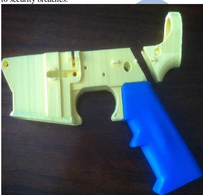
Fig [4]: Gun casted using 3D printing technology

3D printing may be used to produce weapons like, plastic guns, knives etc. that may easily break the security. The transformation of technology may be used by the terrorists or the people with ill deeds to make the weapons that may lead to security breaches.