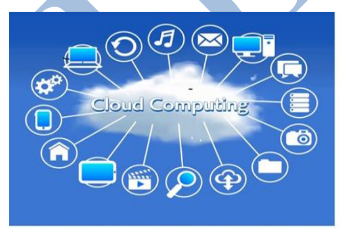
Figur 1: Cloud computing

programs over the Internet instead of your computer's hard drive. develops its own software and application. Cloud computing is The cloud is just a metaphor for the Internet. . Cloud Computing an on demand service in which shared resources, information, use a technology for the internet and central remote servers to software and other devices are provided according to the clients' maintain applications and data. Cloud computing allows requirement at specific time. It's a term which is generally used consumers and businesses to use applications without in case of Internet. The whole Internet can be viewed as a cloud. installation and access their personal files at any computer with internet access. This technology allows for much more inefficient computing by centralizing storage, memory, Load balancing aims to optimize resource use, maximize processing and bandwidth. Cloud computing is a model of throughput, minimize response time, and avoid overload of any network computing where a program or application runs on a single resource. Load balancing is dividing the amount of work connected server or servers rather than on a local computing that a computer has to do between two or more computer so that device such as a PC, tablet or smart phone. Example of cloud more work gets done in the same amount of time, and, in general, computing is like Google, Gmail, Yahoo etc.