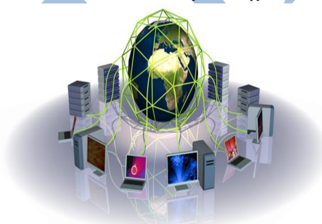
Figure 1: Grid computing

with required software, OS, Hardware and network facility. As (PaaS) Platform as a service, end users are given OS, Hardware, and Network facilities and it is the end user which installs or develops its own software and application. Grid computing is an