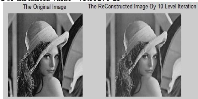
Figure 4. Original And Reconstructed image