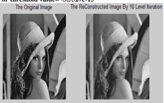
Figure 3. Original And Reconstructed image