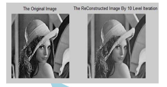
Figure 2. Original And Reconstructed image without threshold value

The tableI has shown below which gives the results of previous scheme and proposed scheme of Fractal Wavelet Compression technique. Both of this schemes of fractal wavelet Compression Technique is tested for 512 x 512 original image of lenna. The Results of performance is shown in table I given below. In this paper we shown that by choosing the threshold value we can reduce the redundancy among domain and range blocks before matching, because there are lots of similar blocks in the block pools. By setting the threshold value maximum number of domain blocks will be eliminated, and few domain blocks will be left. Due to this very small time will be consumed. And finally we obtain the result with very less encoding and decoding time in few seconds and with high compression ratios moreover with good quality of image.