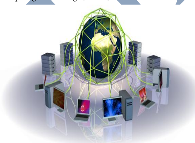
Figure 1: Grid computing

processing and bandwidth. Grid computing is a model of network computing where a program or application runs on a Load balancing aims to optimize resource use, maximize connected server or servers rather than on a local computing throughput, minimize response time, and avoid overload of any device such as a PC, tablet or smart phone. Example of Grid single resource. Load balancing is dividing the amount of work computing is like Google, Gmail, Yahoo etc.