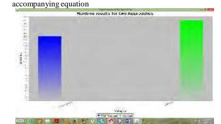
Fig4 The runtime results for different algorithms.