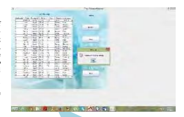
Fig 2: Dataset collection

Since there are no express appraisals for acceptance, we utilize the positioning precision. We receive the generally utilized level of understanding (DOA) and Top-K as the assessment measurements. Likewise, a straightforward client study was led and volunteers were welcome to rate the proposals. For examination, we recorded the best execution of every calculation by tuning their parameters, and we additionally set some broad guidelines for reasonable correlation. For example, for community oriented sifting based strategies, we typically consider the