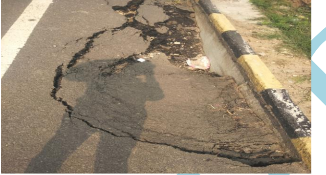
Fig. 3.1 Roadway condition on NH-22 (km 10.735)