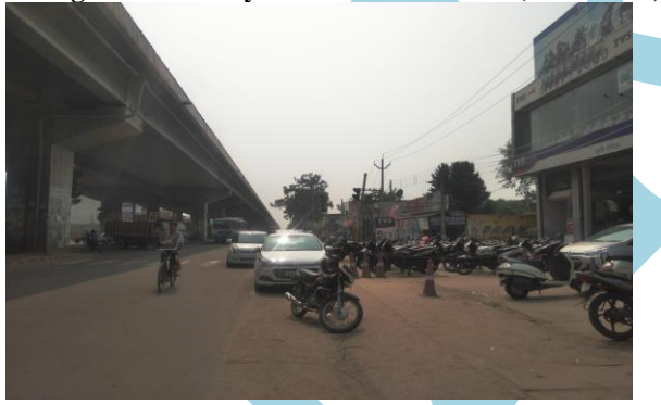
Fig. 3.2 Parked vehicles in no parking zone near TVS agency D