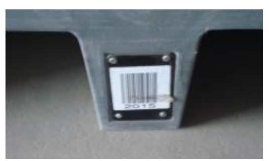
Pallet bar code

A barcode reader (or barcode scanner) is an electronic device for reading printed barcodes. Like a flatbed scanner, it consists of a light source, a lens and alight sensor translating optical impulses into electrical ones. Additionally, nearly all barcode readers contain decoder circuitry analyzing the barcode's image data provided by the sensor and sending the barcode's content to the scanner's output port.