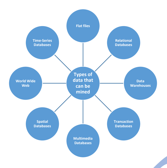
Figure 2: Types of data that can be mined