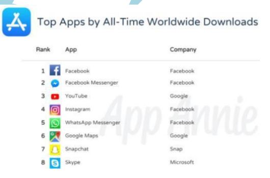
Fig. 3 – Most popular apps on App Store