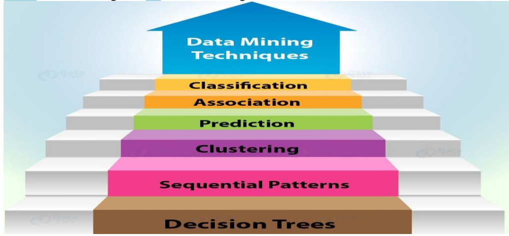
Fig. 1 Data mining techniques

techniques, improve the presentation or decline the expenses of maintaining the business. Additionally, Data mining serves to find new examples of conduct among purchasers [1].