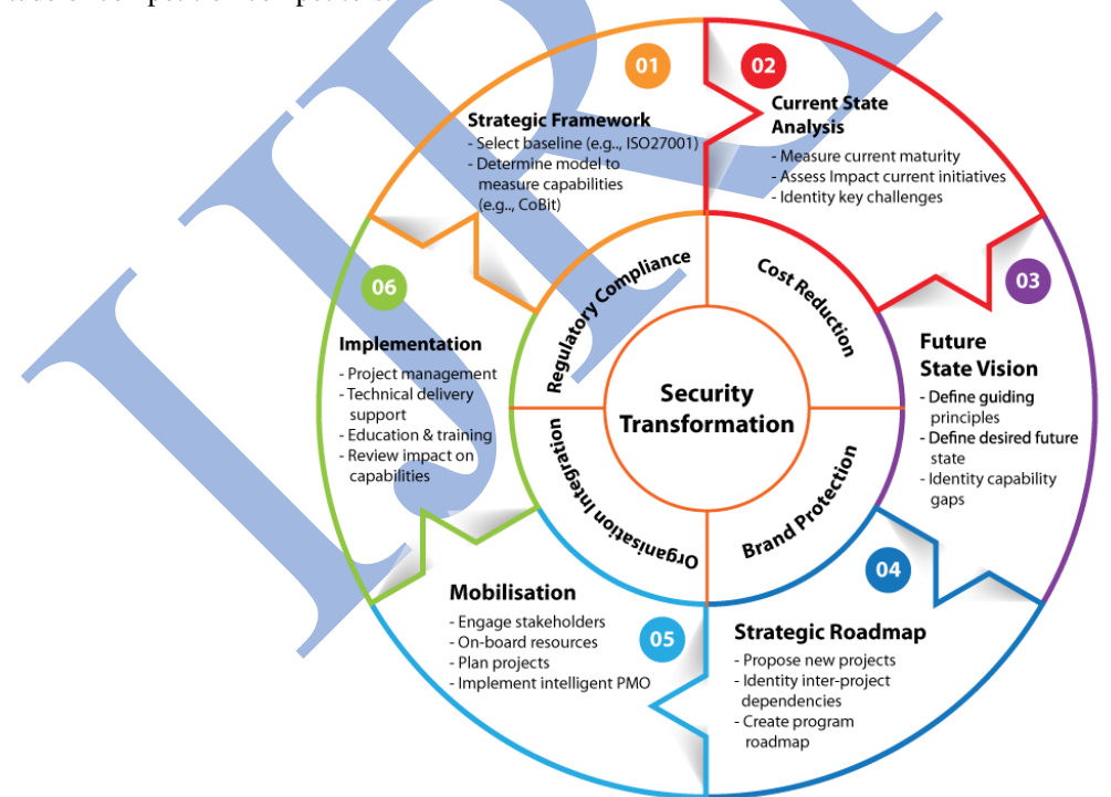
Figure 2 security-strategy-and-transformation

It has recently been discovered that IT workers share some personality qualities in common with each other (Ash et al., 2006a, 2006b; Cruz et al., 2015; Lounsbury et al., 2007, 2009; Rosenbloom et al., 2008; Warren et al., 2012). In a study by Ash et al., IT workers were compared to other types of working professionals in terms of their personality characteristics and career interests. It was shown that IT workers had a lower level of conscientiousness and a greater level of openness to new experiences on the NEO-FFI (a wellestablished "big five" personality test) (Ash et al., 2006a). IT workers are more likely to favour occupations with realistic and investigative themes, according to a second study conducted by the same team using the Strong Interest Inventory (a psychometric measure widely used by career counsellors and occupational researchers).